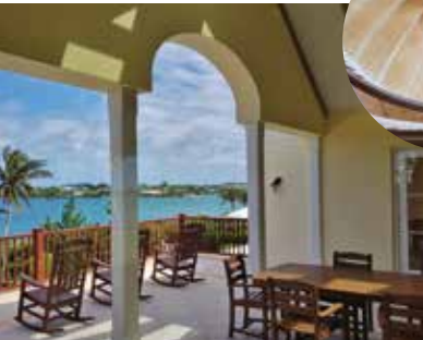
The property features spacious verandas and terraces with ocean views